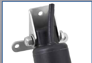
Heavy Duty Mounting

Standard Actuator: our most popular design, operates on all sizes and styles of boats (shown above). Overall length 13 5/8" (346mm).